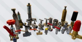
HIGH PRESSURE VALVES