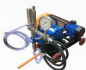
HYDRO TEST PUMP (Motor Driven Unit)