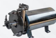
SS SANITARY AND HYGIENIC PUMP