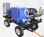
TRIPLEX PLUNGER PUMP