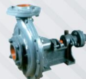
CENTRIFUGAL PROCESS PUMP