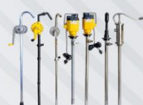
BARREL PUMP AND ROTARY PUMP