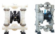
AIR OPERATED DOUBLE DIAPHRAGM PUMP