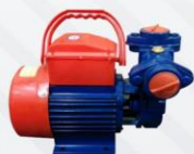
DOMESTIC WATER PUMP