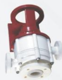
VERTICAL POLYPROPYLENE PUMP