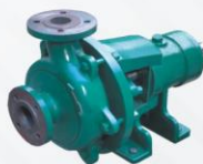
CHEMICAL PROCESS PUMP MANUFACTURER