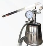
HYDRO PUMP (Fully Made From SS 304 Material)