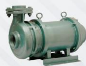
SUBMERSIBLE MONOSET PUMP