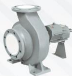
THERMIC FLUID PUMP