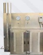
CYLINDER PRESSURE TESTING SYSTEM