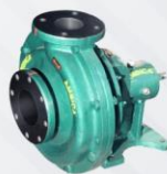
RUBBER LINED PUMP