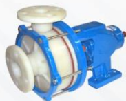
P.V.D.F PROCESS PUMP