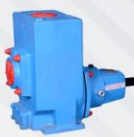
SELF PRIMING NON CLOG MUD PUMP